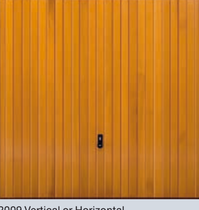
2009 Vertical or Horizontal