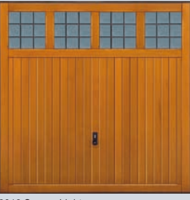
2019 Garage Light