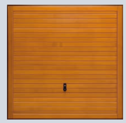
2109 Mallory (Horizontal or Vertical)